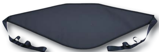
Standard lumbar strap