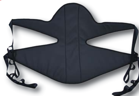
Lumbar strap with dorsal support